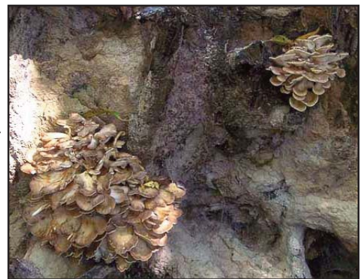
Two Hen-Of-The-Woods growing from the roots of an oak tree that had been blown over in a storm.

-Continued, see Fall Mushrooms on page 2