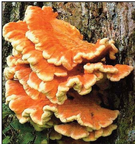
Sulfur Shelf Mushrooms growing on a tree.

They can also grow on a tree that has died and fallen over or is still standing. They can grow anywhere on a standing tree. More than once we've had to go home to get a ladder. Vicky stood on my shoulders to reach the one pictured at right.